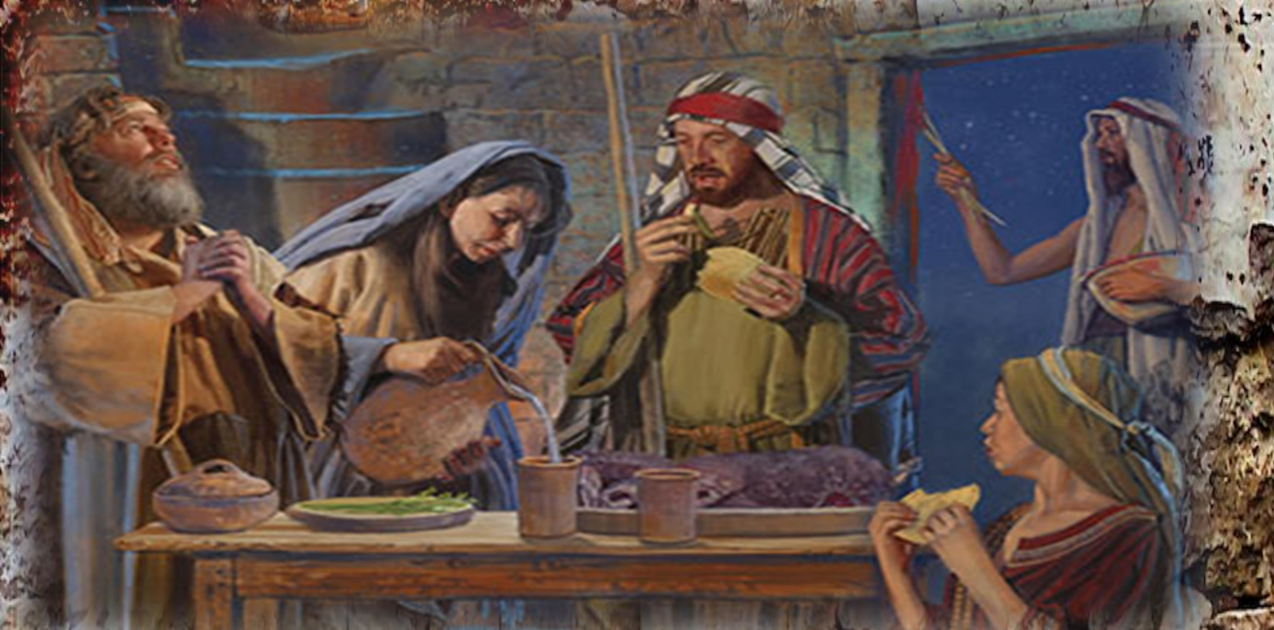
Exodus 12 – Institution of the Passover